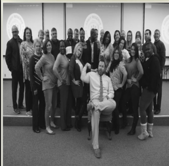
88th RD Family Programs Team stands by ready to assist.